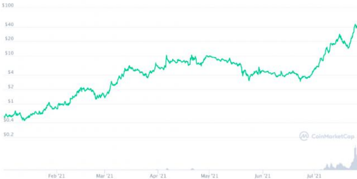
Axie Infinity (AXS) price.

Axie Infinity, a Vietnamese cryptocurrency, has achieved a market cap of $2.5 billion within four years since it was created. Its price has increased 82 times this year to $41 at the time of publishing. It is the 43rd largest cryptocurrency in the world, according to crypto data platform CoinMarketCap.