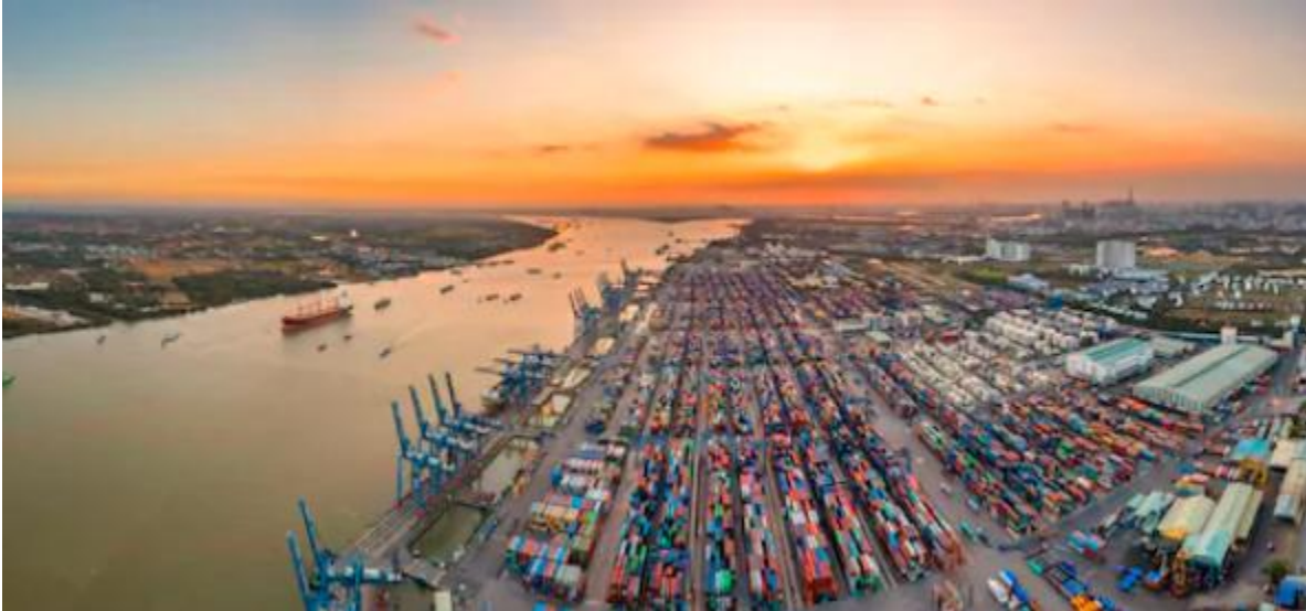
Cat lai Port- Source : Shutterstock.com

Competition between seaports is set to increase in 2020 when more ports open.