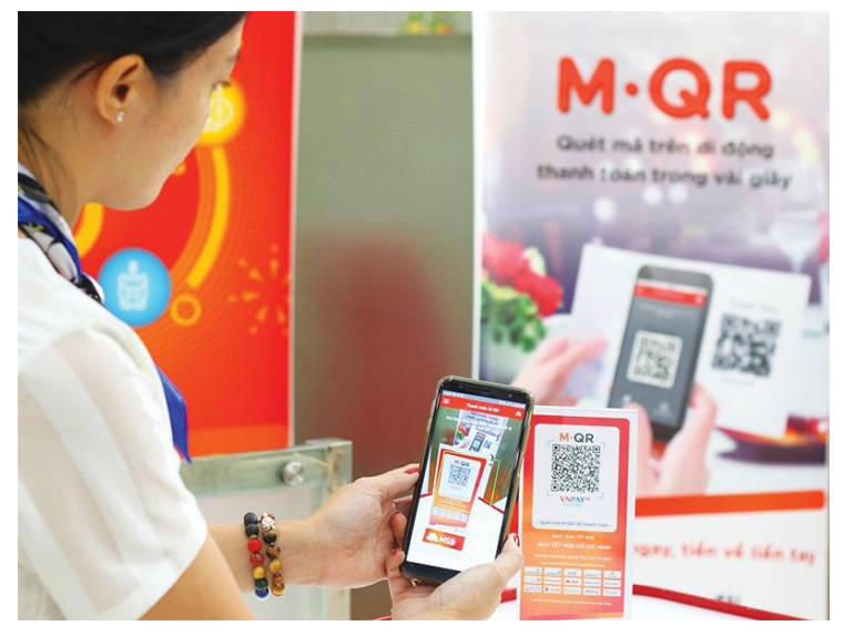
The Vietnamese fintech scene is flourishing, drawing in local and international investors alike

Since the beginning of 2020, the SBV has approved two other non-bank firms, Gpay and Vindiva, to provide payment services.