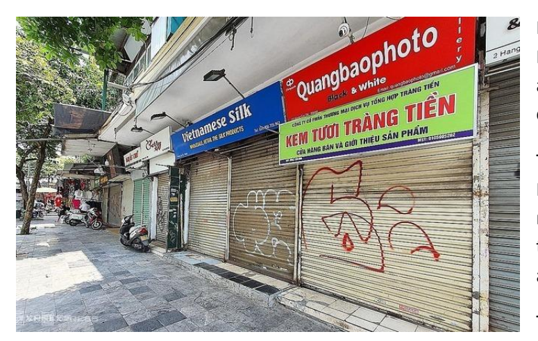
A survey by CBRE in late April of 200 tenants also showed the gloomy situation of the retail premises market. 79% of tenants feared that the business environment would be worse in the last 6 months of the year, while 43% said that the revenue would fall by 10-30% in 2020.

Hue and Hang Bai streets in the central area of the capital city, which has fashion, home appliance and food shops, and is 2 kilometers long, are quiet these days. A lot of shops have been closed. 'For Lease' signs and banners were seen hung at entrance doors of many houses.