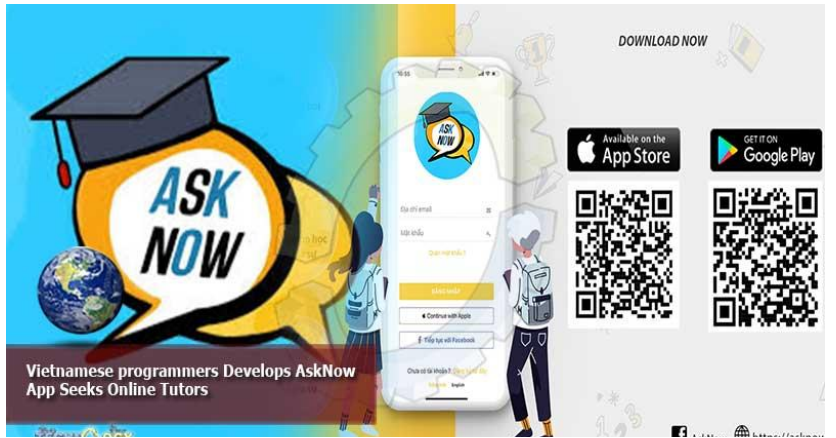
Learning amid the Covid-19 pandemic has become safer and more effective, thanks to apps like AskNow.

An education app developed by Vietnamese programmers, AskNow seeks to help students to interact with a host of qualified online tutors.