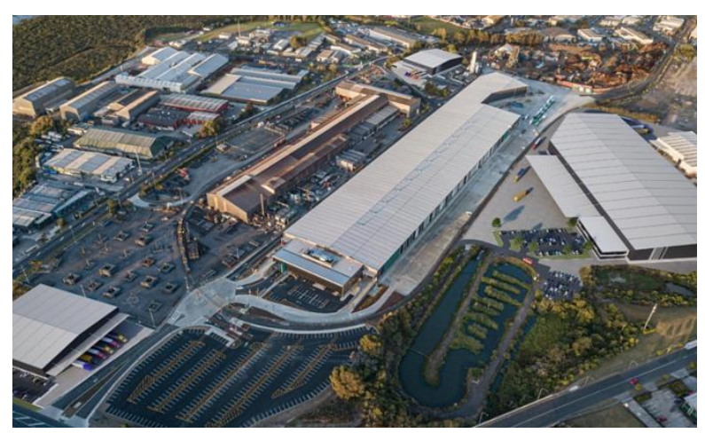
A logistics complex of Logos in Auckland, New Zealand.

Australian company Logos plans to invest $350 million in the logistics real estate segment in Vietnam to take advantage of rising demand in the country.