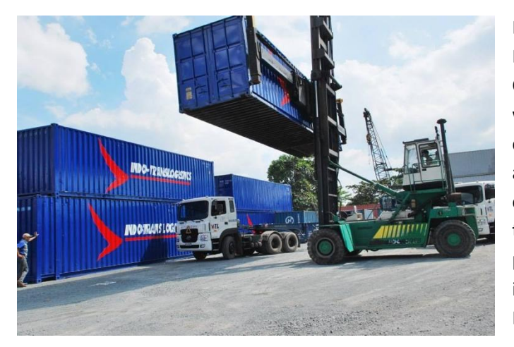
The acquisition of Sotrans Group will bring greater values and enhance the position of ITL Corporation

Indo Trans Logistics (ITL) Corporation today announced the successful acquisition of South Logistics JSC (Sotrans Group), raising its ownership ratio to 97%.