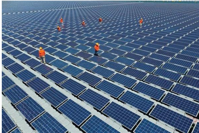
A project of rooftop solar power in HCM City

National electricity demand is expected to increase by 8.5% a year until 2025 and 7% until 2030, making Vietnam an attractive market for foreign energy investors.