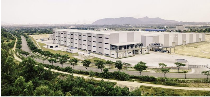
Cleaner and more efficient infrastructure is boosting investor attraction to Danang city

Developing ecological industrial real estate is a new direction for the central city of Danang in its strategy to attract investment into high-tech projects, with many companies interested in large-scale logistics projects manifested by the upcoming Lien Chieu deepwater port.