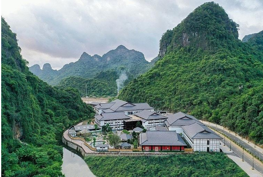
Yoko Onsen Quang Hanh hot spring resort

Never before has luxury healthcare tourism been such a hot trend in the context of the prolonged impact of dangerous diseases like COVID-19 on the whole world.