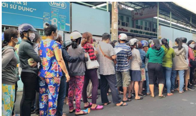
The long queues of people standing and waiting for their turn to buy face masks show the great potential of the drug and medical equipment market.

While many retail chains have had to shut down or reduce operations because of Covid-19, drug retail chains have been thriving because of the increased demand. This has prompted retailers to expand their chains.