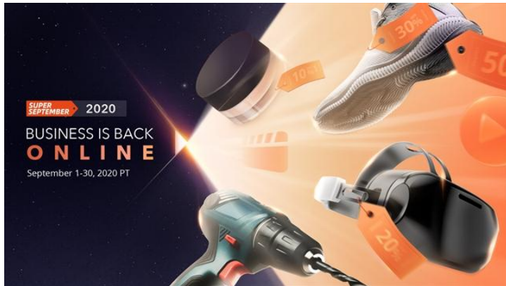
Alibaba.com kicked off 'Super September 2020', its largest annual event designed to help small-and-medium enterprises (SMEs) trade and thrive

Alibaba.com, the leading global business-to-business (B2B) e-commerce platform, has rolled out two initiatives this September to empower its Vietnamese sellers.