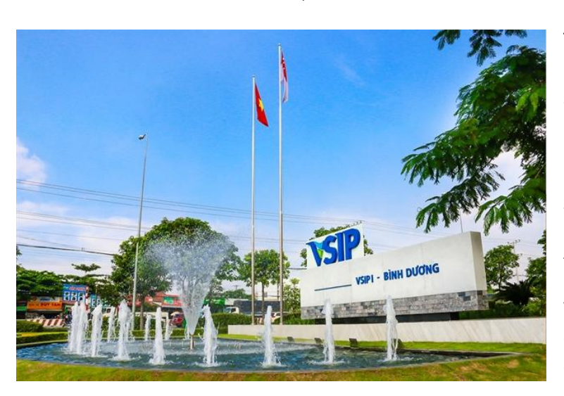
Singapore has been the largest foreign investor in Vietnam this year

South Korea was the second with $2.97 billion and China was third with $1.75 billion.