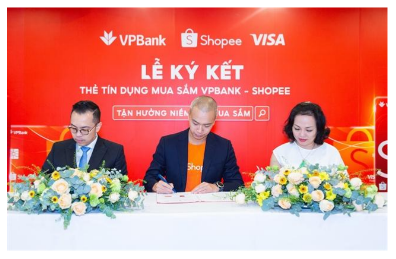
Shopee, Visa and VPBank launch their first co-branded credit card in HCM City on Monday

E-commerce platform Shopee, VPBank and Visa on Monday launched their first co-branded credit card with an eye on the fast-growing online market.