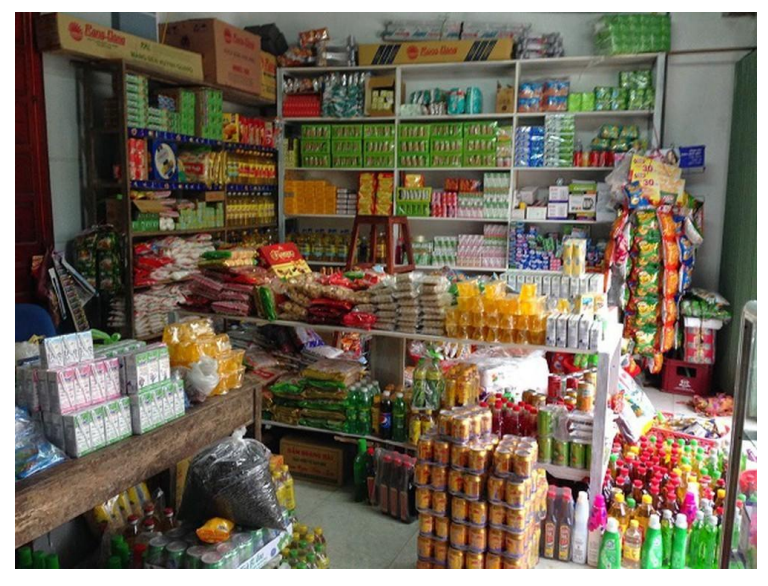
Contrary to all predictions, modern convenience stores and supermarkets, with powerful financial capability, have not led to the closure of traditional household-run groceries.

Many convenience store chains, such as VinMart, Circle K, Family Mart, Co-op Smile and Satrafoods, have opened, present in every residential quarter and satisfying all consumers' needs, from needles and thread to vegetables and fish.