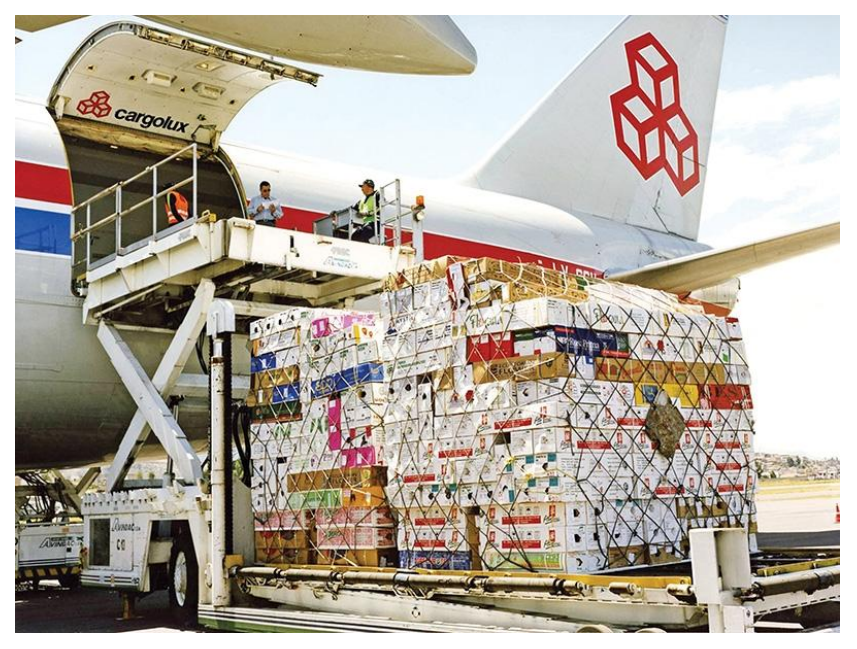
Local airlines combine repatriation flights with low-cost deliveries of agricultural products to support local producer

With that, and some creativity and ambitious plans to establish domestic cargo transport for international routes, hopes are high that the country's fruit and vegetables can soon be delivered to consumers overseas.