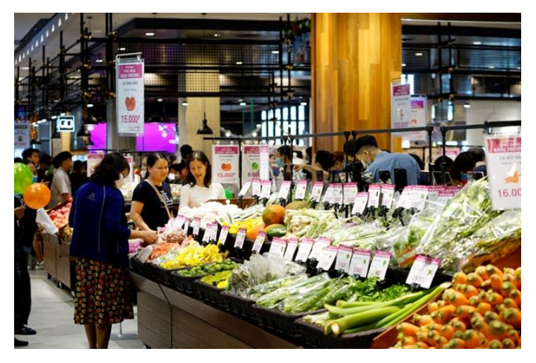
Fresh food area' provides vegetables and fruits, products certified by GLOBAL GAP, VIETGAP, attracting many customers in the Hai Phong City

Hai Phong residents are also the first customers in Southeast Asia to experience innerCasual (IC) products - AEON's own brand. AEON Vietnam also put into operation two more specialised stores, including the Glam Beautique beauty and health store and AEON Bicycle.