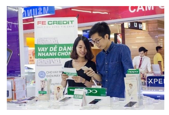
At its annual general meeting this year, VPBank, the parent company, announced plans to sell stakes in FE Credit to foreign investors

A spokesperson for FE Credit Consumer Finance Company said the Covid-19 pandemic had somewhat affected the company's business but the price of its stock would not change thanks to its advantages and the market's great potential. He said the deal would be completed in 2021.