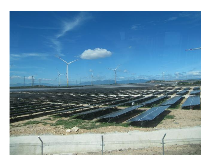
A solar power and wind power farm is put into operation in the south central Ninh Thuan Province. Vietnamese businesses are urged using renewable energy in boosting competitiveness and sustainable development

The Vietnam Corporate Energy Leaders (VCEL) initiative was announced at the Vietnam Corporate Sustainability Forum 2020 on Thursday, promoting the use of renewable energy in driving greener production and sustainable growth in a globally competitive Vietnam.