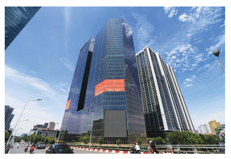
Foreign inflows for Vietnam's real estate bouncing back

The first major signs of a resumption of investment activity have emerged in the real estate market with new brand names entering and others expanding their portfolios in Vietnam.