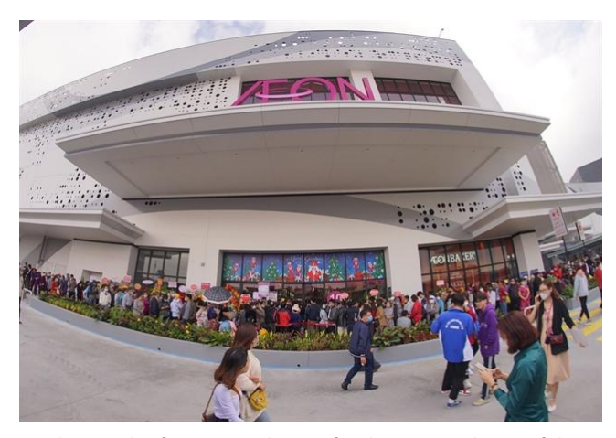
Thousands of customers line up for the opening hours of the AEON – Hai Phong Le Chan General Merchandise Store and Supermarket in Hai Phong City on December 14

The AEON – Hai Phong Le Chan General Merchandise Store and Supermarket officially opened its doors for customers in Hai Phong City on December 14.