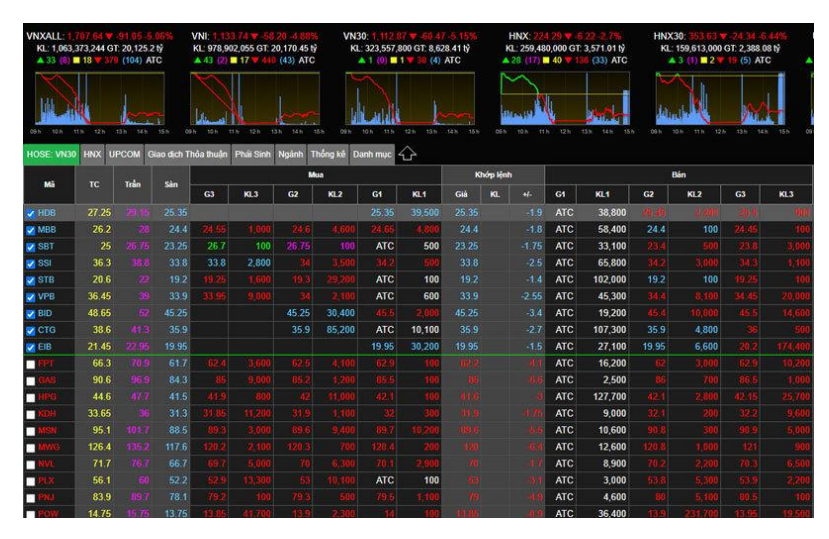
The Vietnamese stock market saw an unprecedented plunge on January 19

The Vietnamese stock market saw an unprecedented plunge on January 19. But panic did not occur.