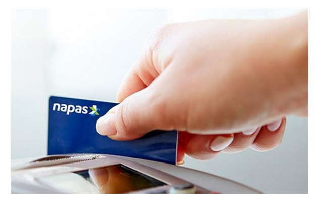
Domestic credit chip cards with unified standards were expected to be introduced this week

The National Payment Corporation of Vietnam (Napas) last week said it would work with seven banks to introduce domestic credit chip cards with unified standards to limit cash payments and tackle black credit.