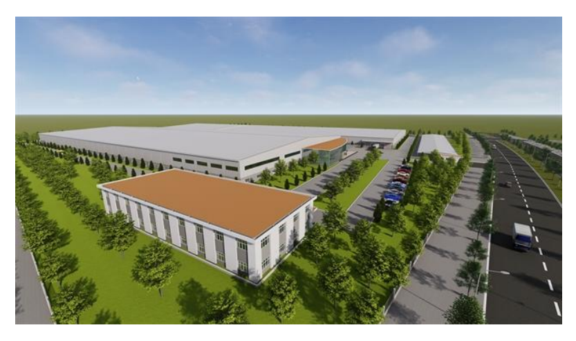
A plan of the United States Enterprises plant. The central city's industrial zones and hi-tech park authority has granted an investment licence to the United States Enterprises plant project worth US$110 million

He added the plant will focus on machining and fabrication specialists for quartz, ceramic and silicon and other materials such as aluminium oxide, mono and poly-crystalline silicon and sapphire.