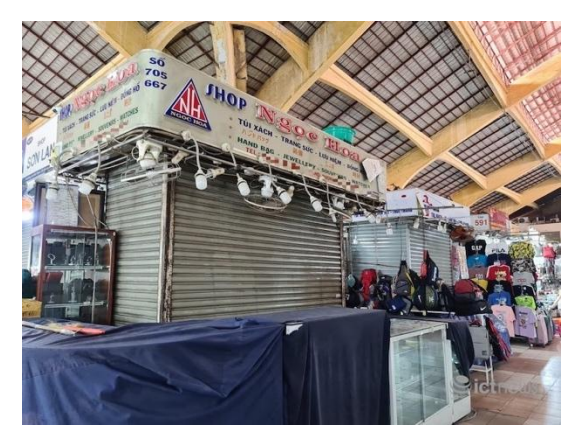
Many stalls in Ben Thanh market are closed

According to a trader, Ben Thanh Market has about 1,400 stalls. However, because of Covid-19, the market lost a lot of foreign tourists and overseas Vietnamese customers. As a result, half of the stalls have closed in the past months. As demands rise when Tet nears, some traders reopened their stalls and about 20 traders moved their shops online.