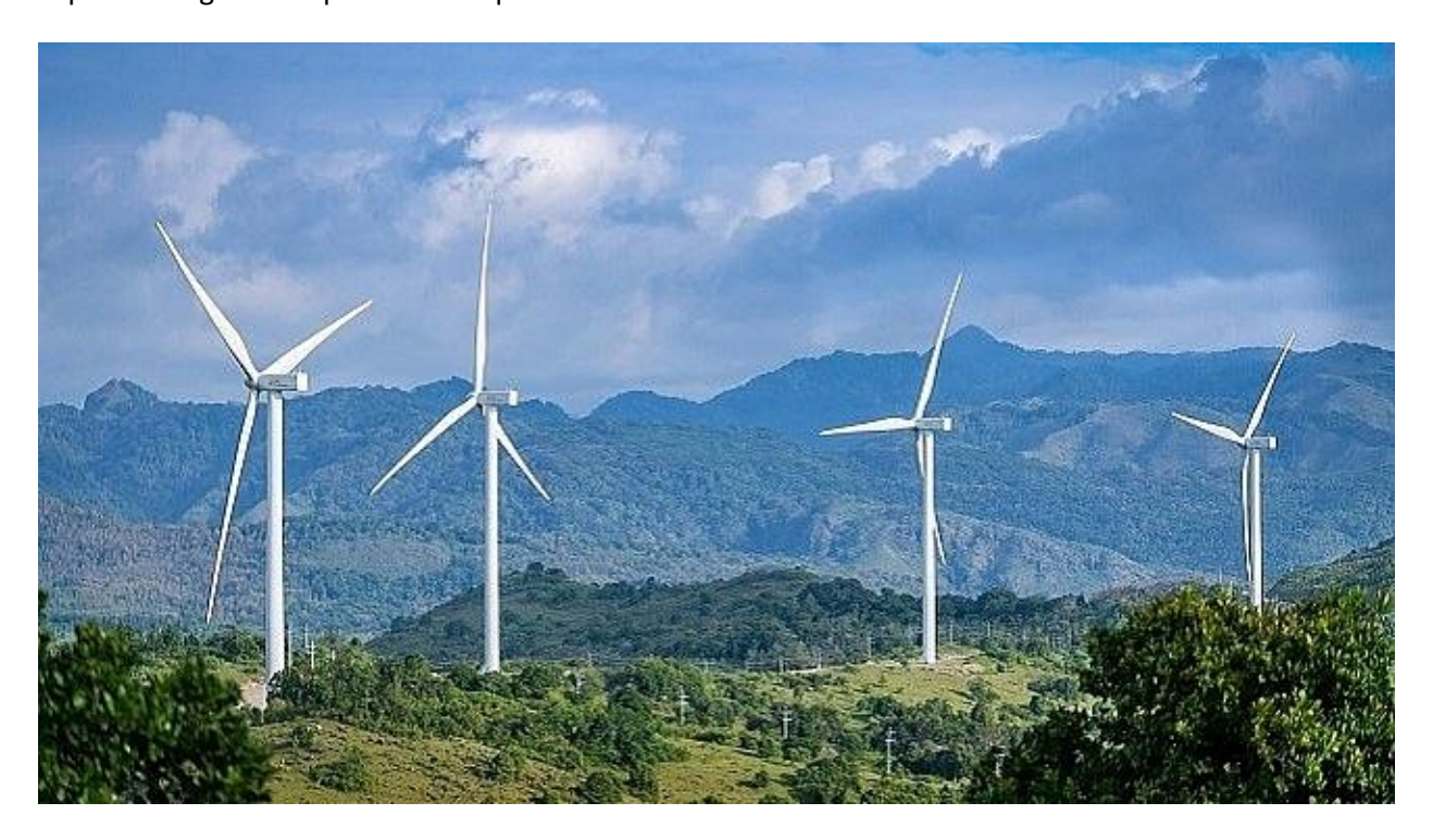
GE is looking to construct wind farms in Lang Son

The second one is the 253MW Ai Quoc project. Covering an area of 3,817ha in Loc Binh and Dinh Lap districts, the project would have a total investment capital of VND12.9 trillion ($560.86 million), expected to generate power in the period of 2024-2025.