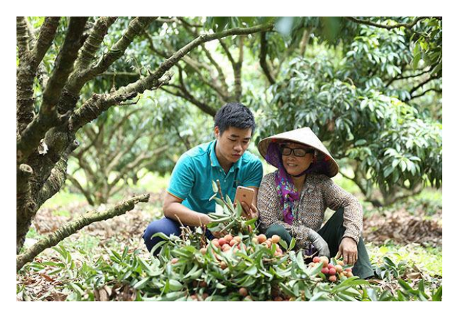
Vietnam has great advantages for digital transformation, including a population of 100 million, and a high%age of internet and smart device users, accounting for 70% of the population.

Displaying local specialties on e-commerce platforms has proven to be the quickest way to increase the value of Vietnam's farm produce and introduce it to international customers.