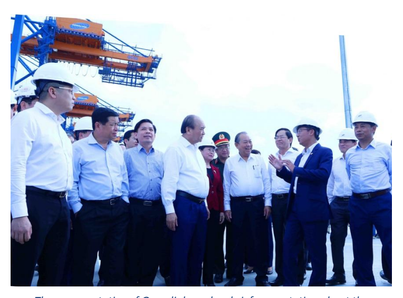
The representative of Gemalink made a brief presentation about the development of the port to Prime Minister Nguyen Xuan Phuc

Gemalink Port, Vietnam's largest deep seaport, will put into use at least 80% of its designed capacity this year and reach its full capacity of 1.5 million TEU by 2022.