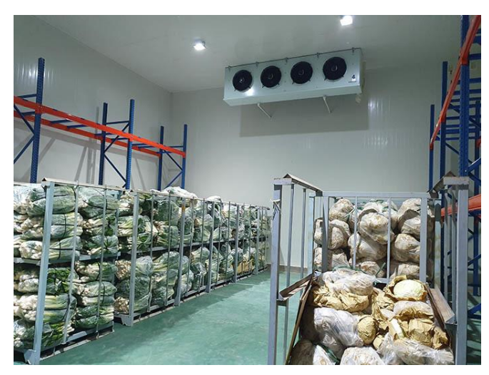
Analysts said they can see a cold storage construction boom. According to Emergen, cold storage construction volume will have value of $18.6 billion by 2027, with an average growth rate of 13.8% per annum.

The growing tendency of consumers shopping online globally has led to a sharp demand for cold storage warehouses, but investment in cold storage facilities remains modest.