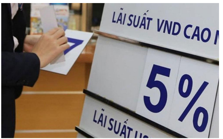
Experts said that interest rate increases are occurring only at a few banks, and that interest rates will stay low because the pandemic has led to a drop in credit demand.

After many months of staying at low levels, deposit interest rates at banks have increased since late May.