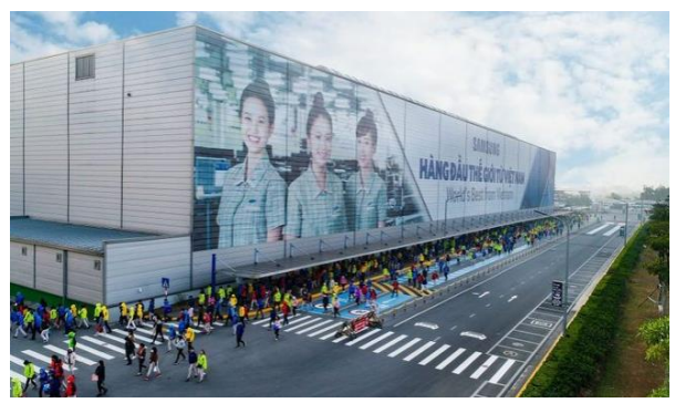
center was about 85% complete.

Samsung is testing its ball grid array products and will mass produce them at the tech giant's factory in northern Thai Nguyen Province in July 2023.